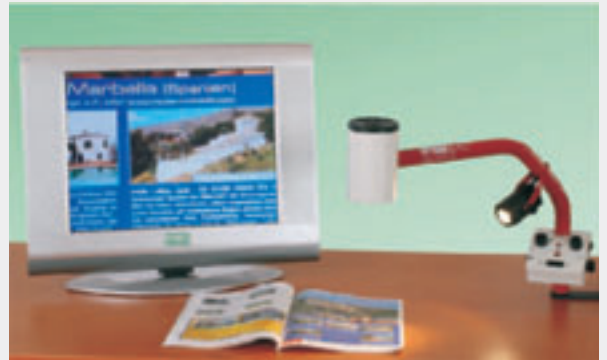
The PCT is compatible with televisions, standard and LCD monitors, ...

The PCT offers many display options. It can be used with a television or with a computer monitor. It can also be connected to a computer or to a laptop. Different models and various accessories help to find the best match of options for each user's individual preferences.