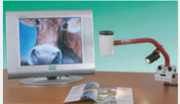
The PCT's innovative design, state of the art technology, ...

Turning the camera on the sturdy swivel arm displays the surroundings on the monitor. Blackboards, overhead projectors, flipcharts - the PCT's infinitely variable zoom and its autofocus produce an excellent image quality in the desired size. With OPTRON's TwistCam™-technology the camera can be rotated to almost any angle – the picture on the display is always perfectly upright and leveled.