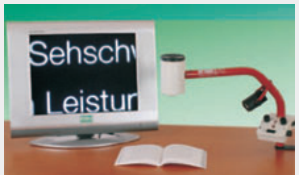
...and its wide range of functions provide outstanding performance and flexibility.