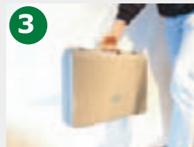
Traveling is safe and easy with the PCT