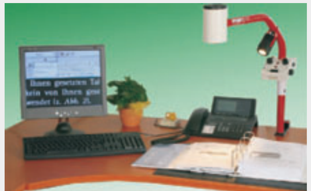
... computers and laptops